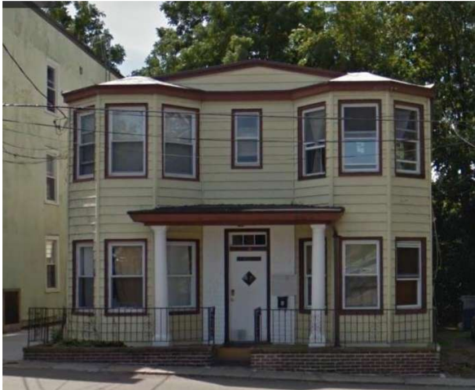
10 West Main Street, Hastings on Hudson