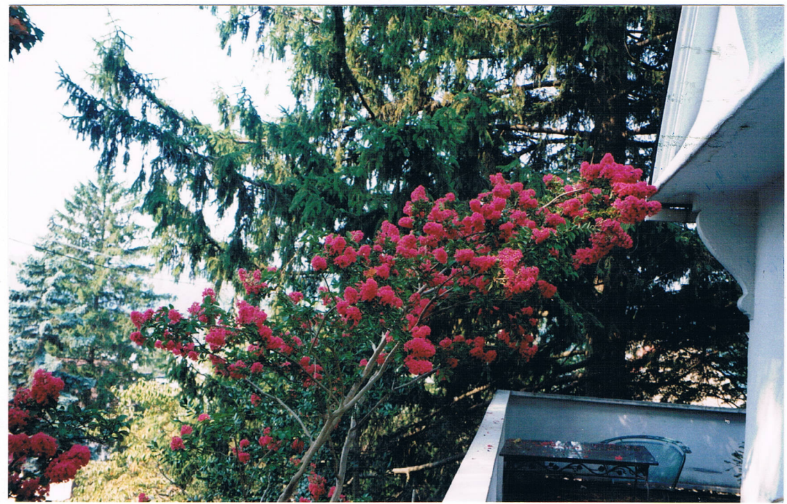
TREE Crape Myrtle, 11 Villard Avenue