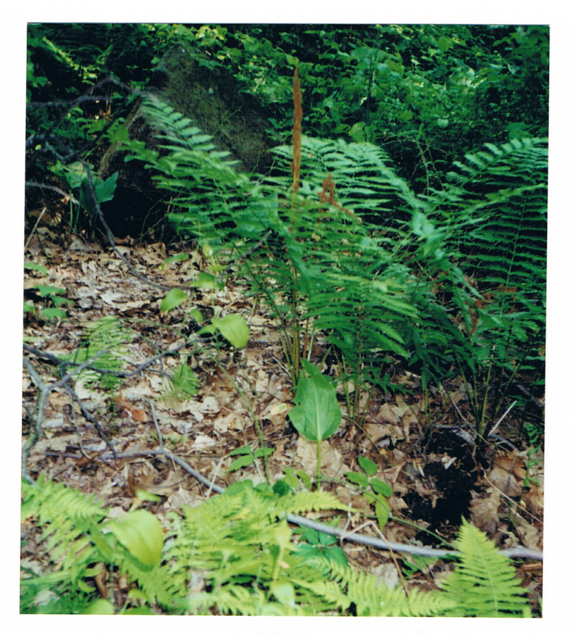
FERN Cinnamon Fern, North of Sugar Pond, Hillside Park