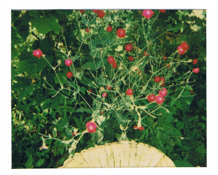
HERBACEOUS Rose Campion, Rowley's Bridge Trail