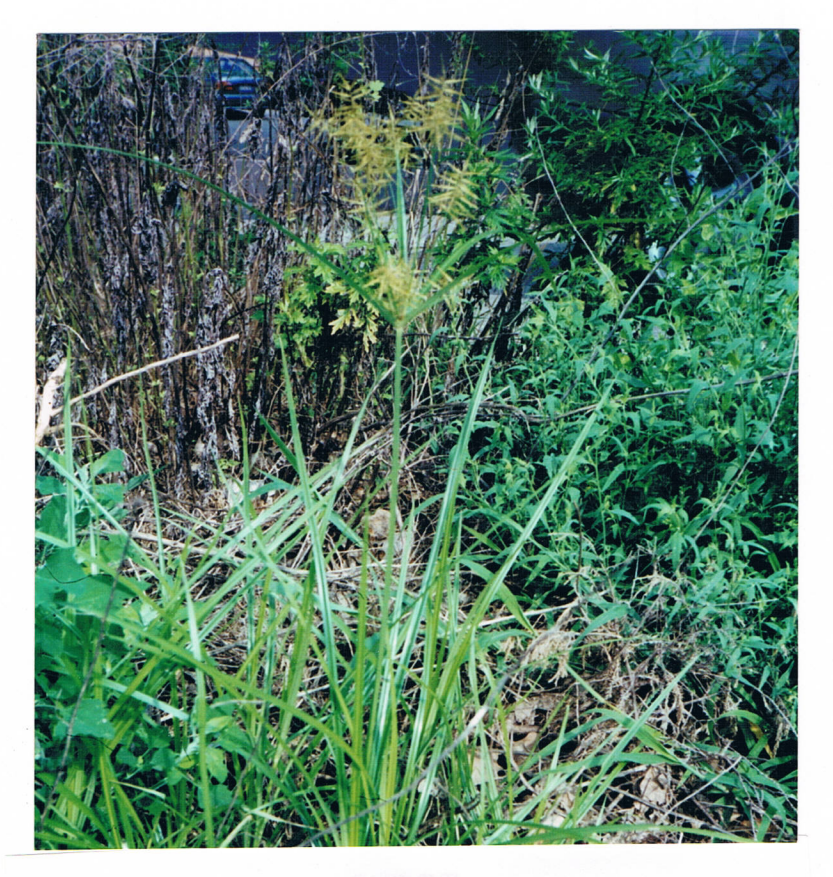
SEDGE Yellow Nutsedge, Zinsser Community Gardens