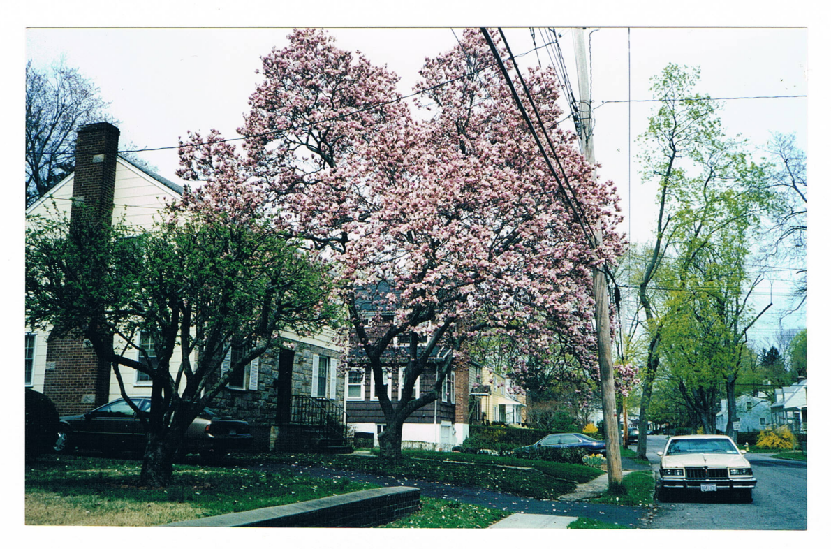
TREE Sargents Magnolia, Whitman Street