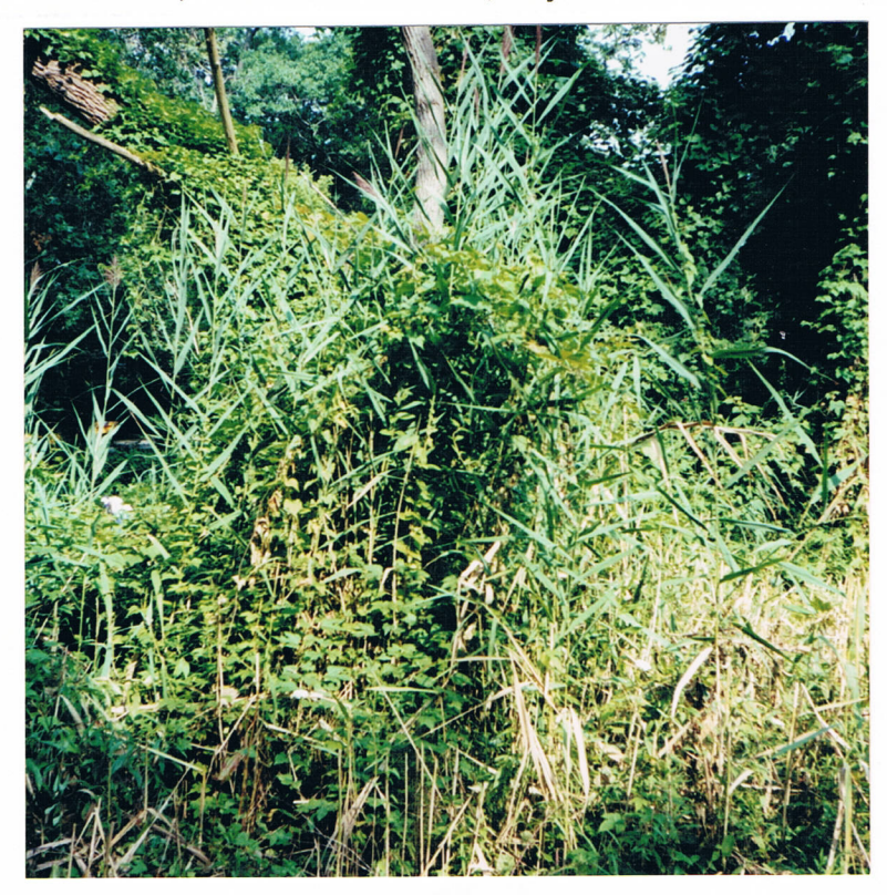
GRASS Reed Grass, Phragmites, Zinsser Community Gardens

Meadow Horsetails, Southside Avenue, Adjacent to Railroad Tracks, April