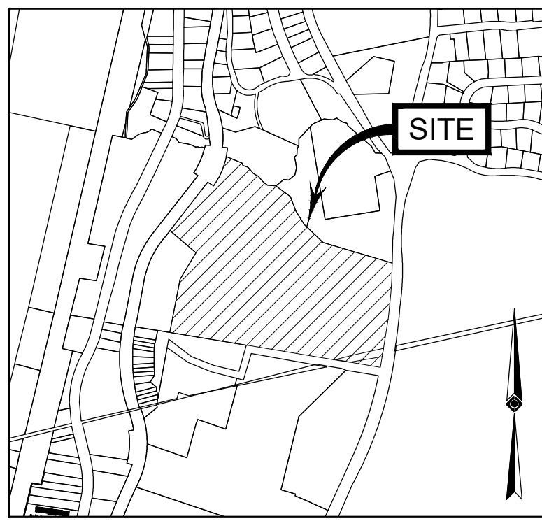
SITE LOCATION MAP SCALE: 1" = 800'