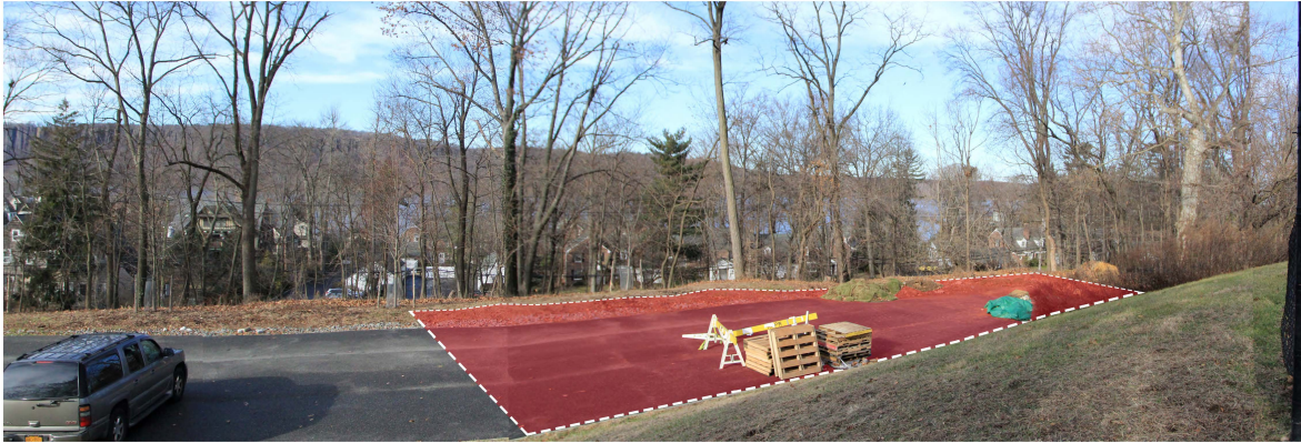
① ZINSSER PARK; VIEW WEST TOWARDS PARKING LOT