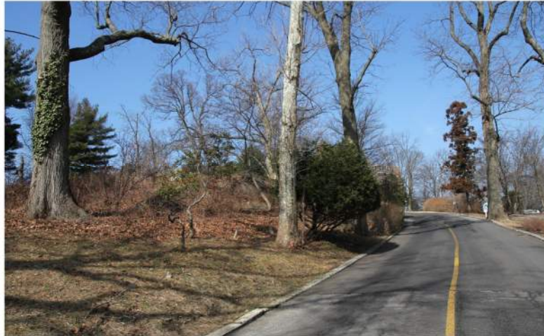
1 View from Entry Drive EXISTING