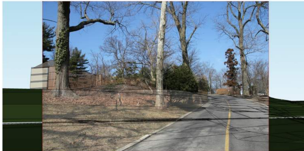
1 View from Entry Drive PROPOSED