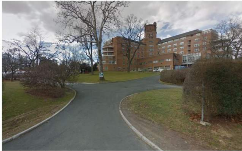
A View from Broadway Northbound EXISTING