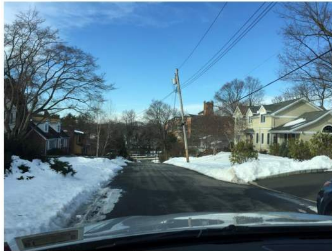
C View from Upper Hudson Street EXISTING (WINTER)