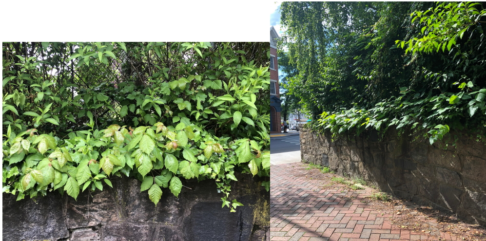
Poison Ivy cascading into walkway at Hardware Alley, March and June 2020

The alley that runs along the side of the VFW Plaza and connects the north end of Boulanger Plaza and Warburton is currently a graceful, pedestrian-friendly area of the downtown. This is an area which is already an attractive point in the Village but could be improved. In the medium term, the alley should be considered in the context of decisions made regarding VFW Plaza. In the short term, there are important maintenance issues in the alley, including a huge cluster of poison ivy that cascades over the edge of the wall around the same height of a passer-by. In addition to plant maintenance issues, we recommend creating a lighting system through the alley to highlight its beauty. Finally, the wall of the hardware store is an area that could serve as an “Art Museum in the Streets,” with fixed display cases that rotate and showcase the work of local artists.