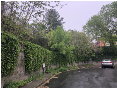
Proposed Bike Parking site, March 2020

In the far northeast corner of the Boulanger parking lot there is a car parking space adjacent to the corner of two granite walls. The proposed bike parking structure would take this spot and have a covering that is buttressed by the two walls. This proposed location would require the elimination of one car parking slot in return for twenty spaces for bike parking. See page 19 of the PGA Master Plan for the conceptual drawing of this location.