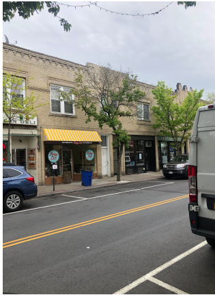
Half-dead tree in prominent location, Warburton, March 2020