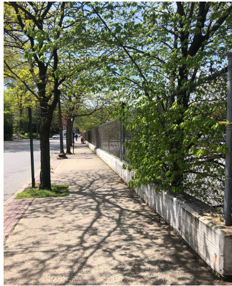
Sidewalk along Foodtown, trench could be cut to plant ivy along chain-link fence, potential for green wall, March 2020