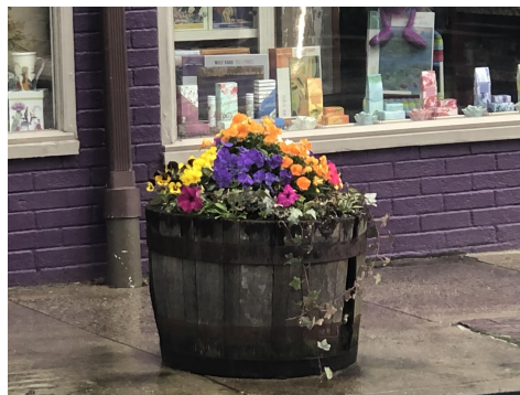
Inconsistent and broken flowerpots, glorious contributions of Beautification Committee, March 2020