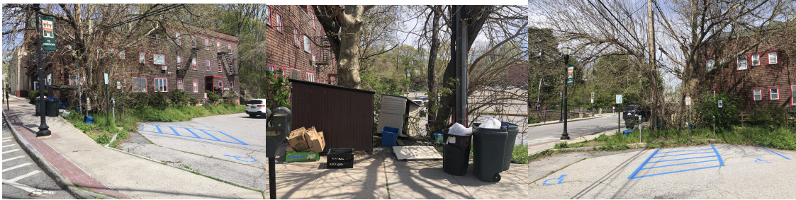
Proposed Bike Parking site, currently overgrown, teeming with trash. March 2020

In the far northeast corner of the Boulanger parking lot there is a car parking space adjacent to the corner of two granite walls. The proposed bike parking structure would take this spot and have a covering that is buttressed by the two walls. This proposed location would require the elimination of one car parking slot in return for twenty spaces for bike parking. See page 19 of the PGA Master Plan for the conceptual drawing of this location.