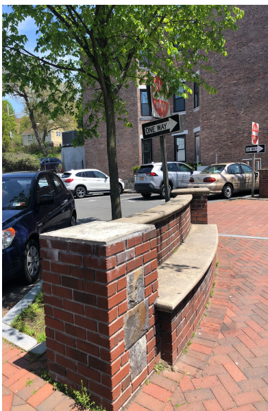
Capstone missing at entry to Boulanger Parking, March 2020