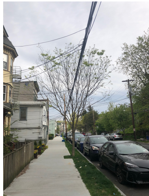
New sidewalks by county, lack of protection of trees, March 2020