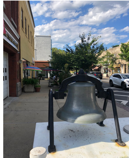
Beloved bell, view toward Firehouse Plaza June 2020