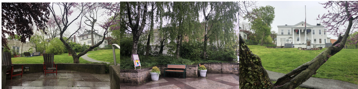
VFW Plaza, March 2020