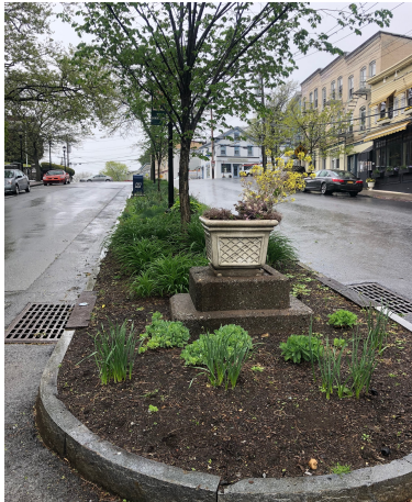
Southside Avenue Divider. March 2020

This divider was planted in years past. While it has some specimens which have survived, it is spotty and sparse and would make a great visual impact if plantings are refreshed