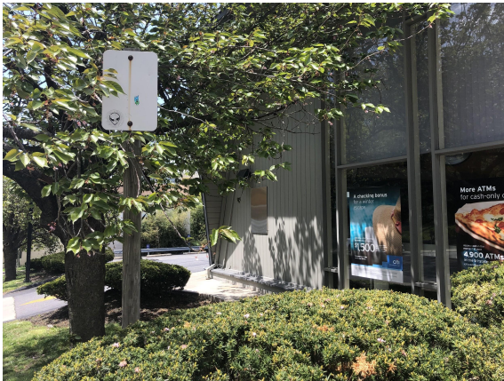
Useless signage should be removed, March 2020