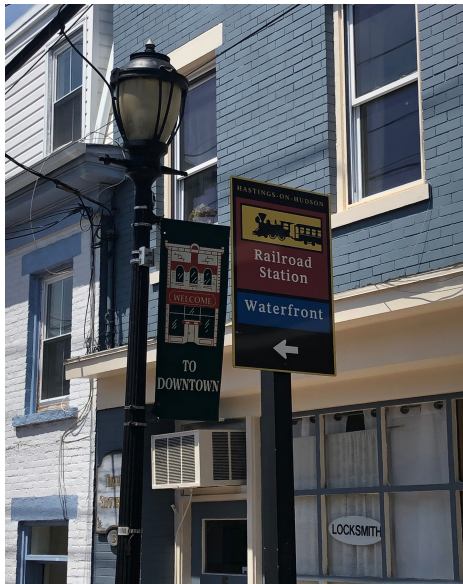
Generic Flag should be removed, lampposts should be decluttered. March 2020