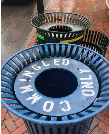
Trash cans and side door to cans left open, March 2020

well as the addition of recycling cans. Please see the models provided in the PGA document on page 11. These options should be evaluated with the DPW and Conservation Commission. Page 11 of the PGA report includes a map of suggested trash and recycling locations.