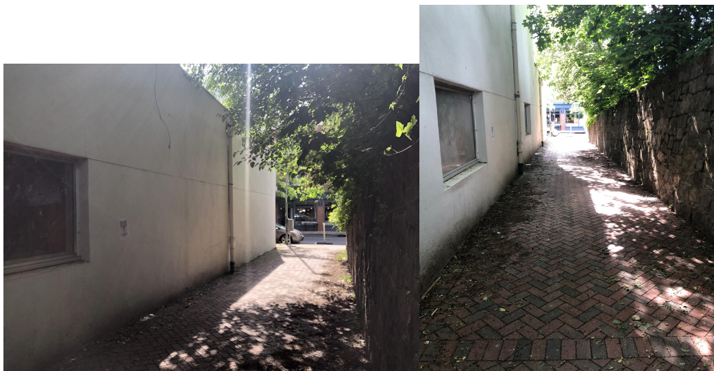
Hardware Alley, June 2020