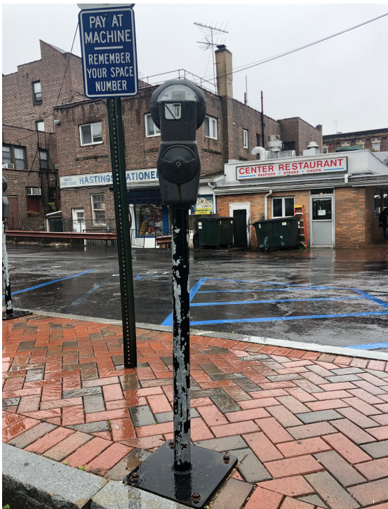
Parking meters tilted and in-need of paint, March 2020