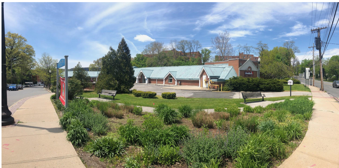
Impressive flower bed at Five Corners. Grassy strip behind walkway should be filled with “Green Curtain” to hide peeling paint roof of Foodtown. March 2020

At the intersection of Five Corners, the area behind the entrance sign to the Village has arborvitae bushes of varying condition, grass and two benches. This area should be replanted with bushes and trees that can provide a “green curtain” or backdrop to the Village sign and established garden planted by members of the community.