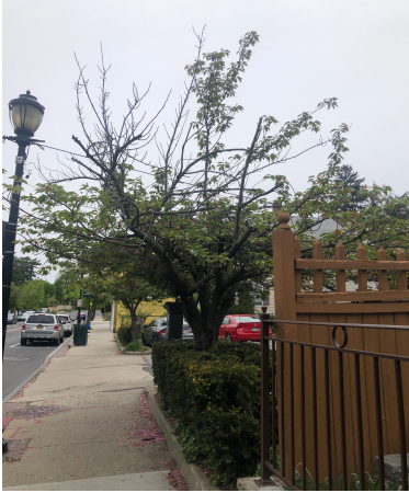
Proposed Bike Parking site, Post Office Parking lot. March 2020

There is no bike parking available at the library. Adding spaces at the lower library entrance could also support customers attending the Farmers Market as well as events at Village Hall.