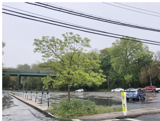
Neglected and overgrown planting areas, March 2020