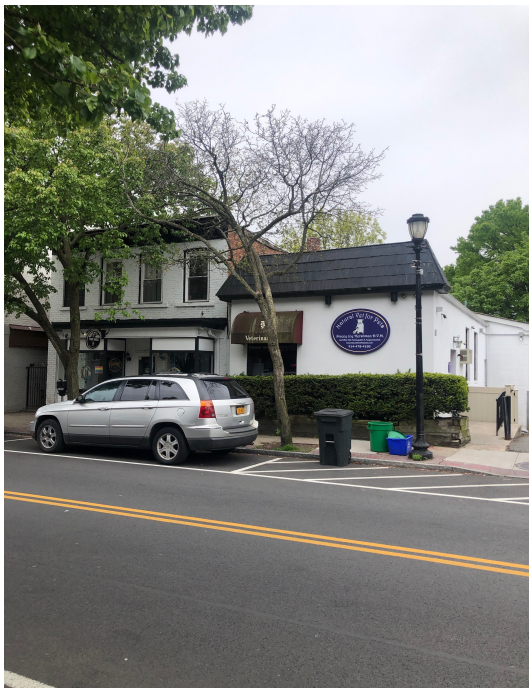
Dead tree on Warburton, March 2020