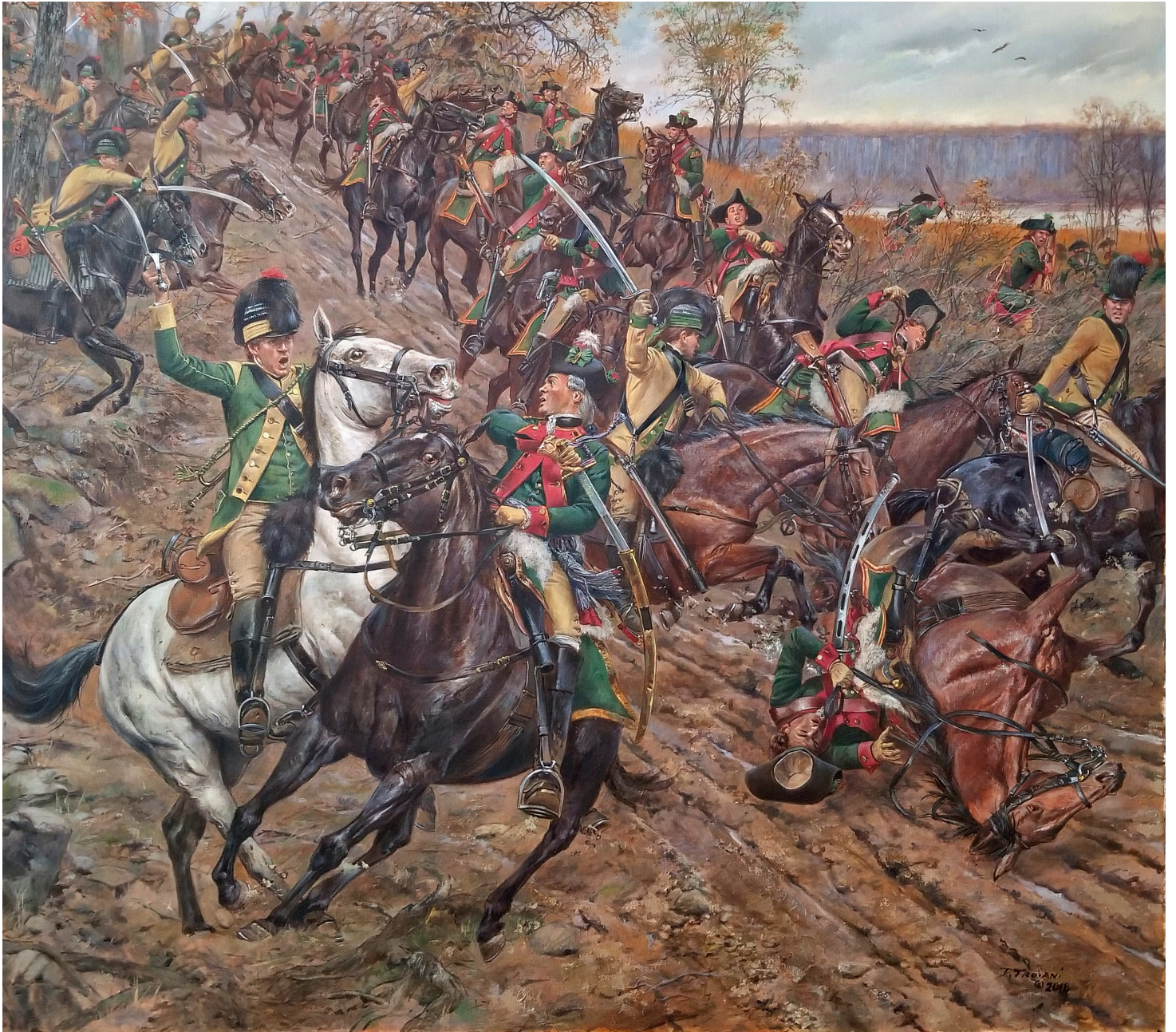
The Battle of Edgars Lane Don Troiani, American Oil on canvas, approx. 30" x 34" 2018