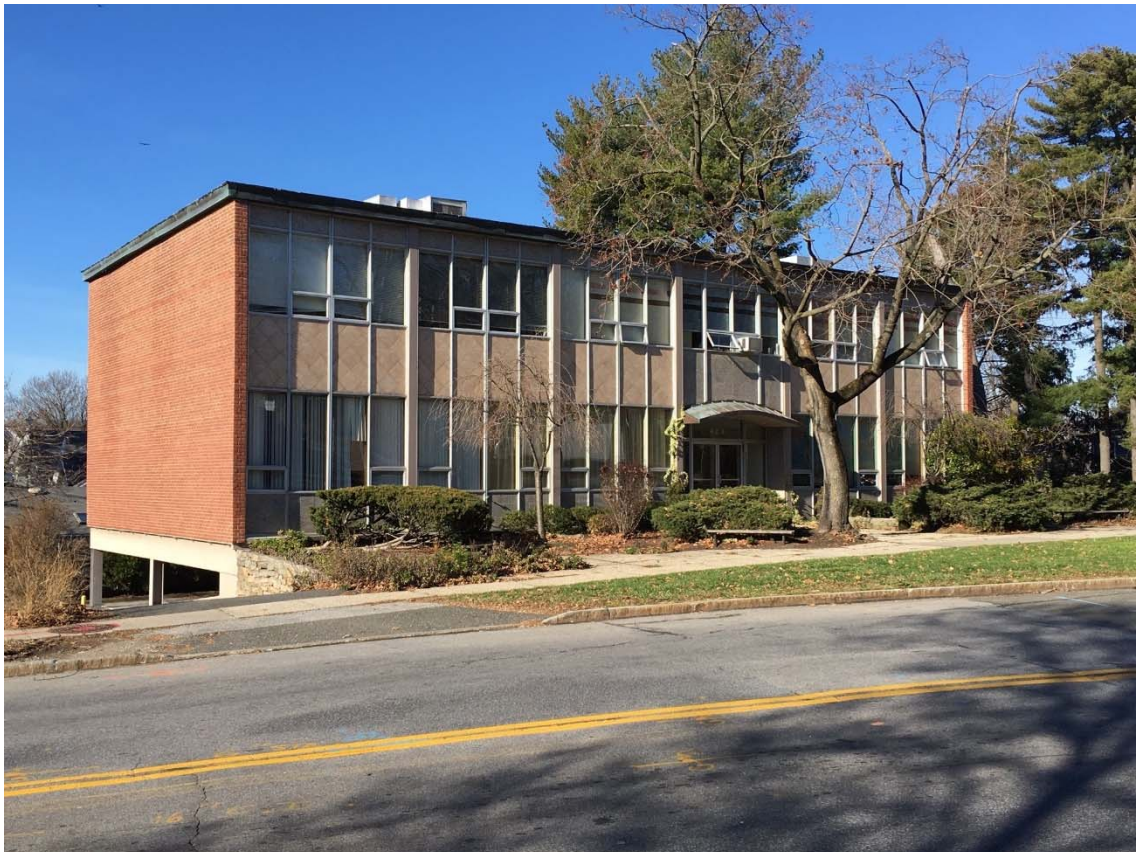
623 Warburton Avenue Looking West