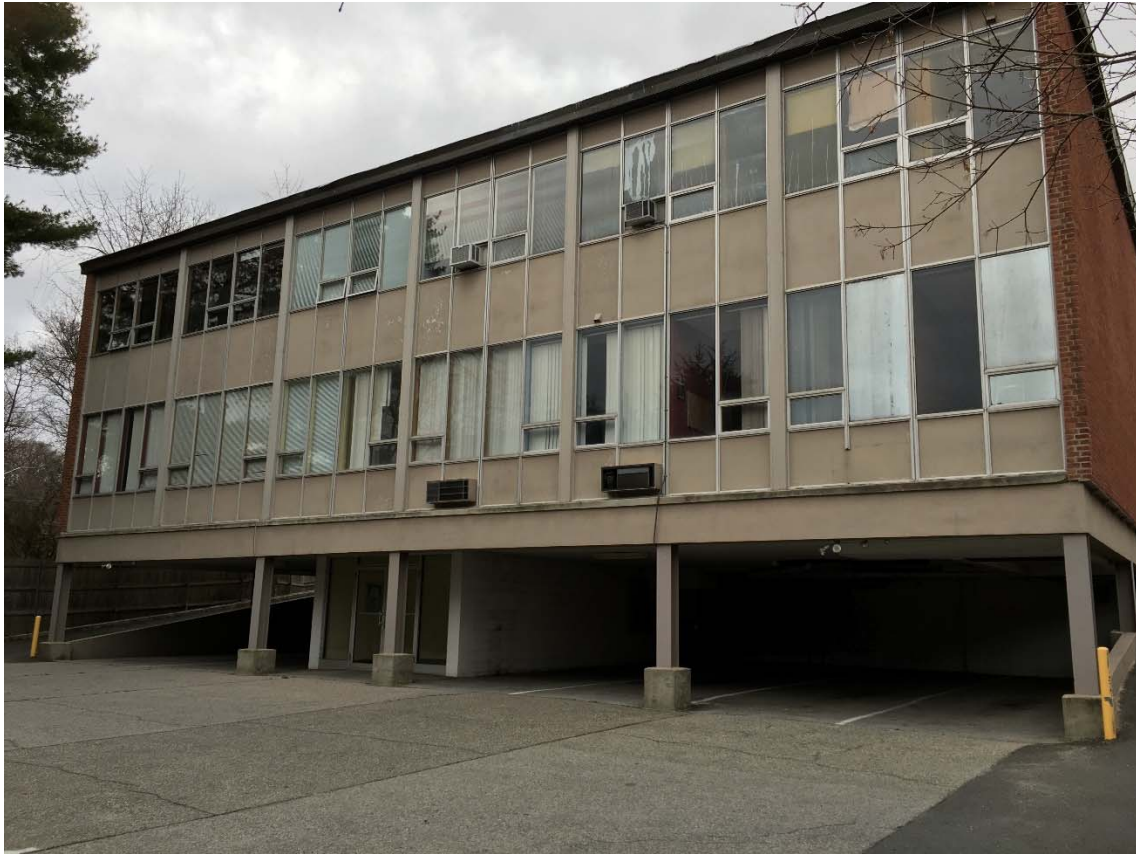
623 Warburton Avenue Looking East